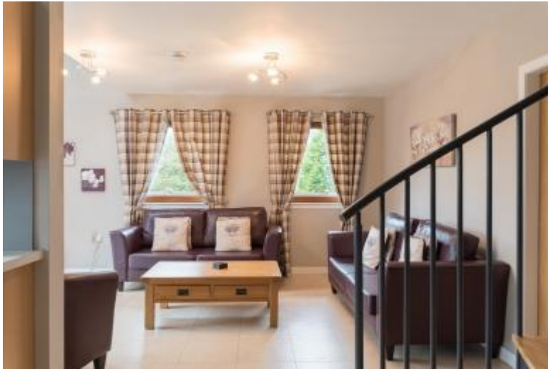
Lounge from Dining Area