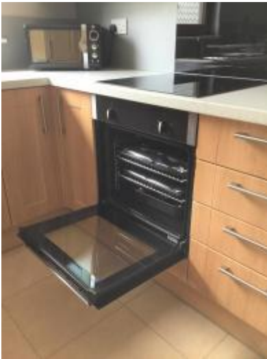
Oven and Hob