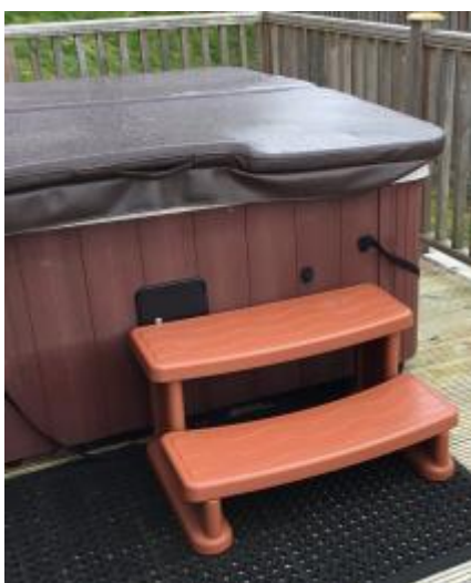
Steps for Hot Tub