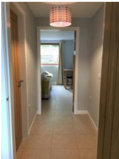
Entrance to Downstairs Bedroom on Right Hand Side