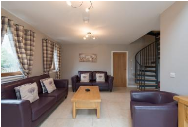
Lounge from Entrance