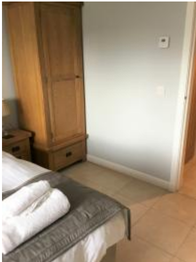
Downstairs Bedroom to Left Hand Side