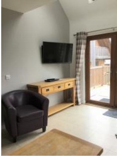
TV in living area