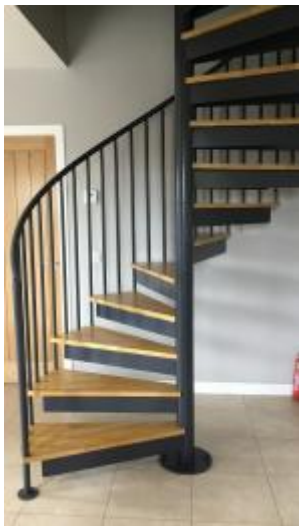
Spiral staircase leading to upstairs bedrooms