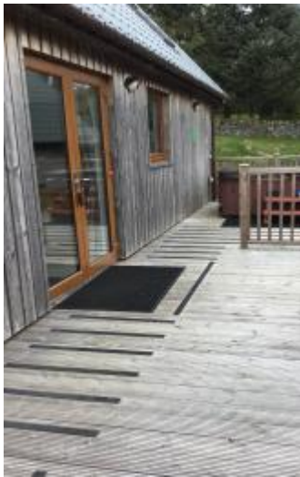
Decking leading to patio doors and hot tub