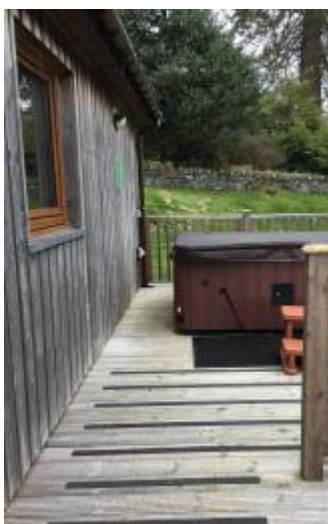
Entrance to Hot Tub Area