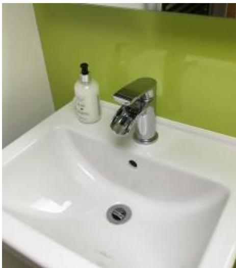
Tap in Downstairs Bathroom