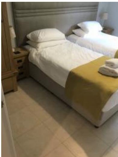
Downstairs Bedroom on Right Hand Side