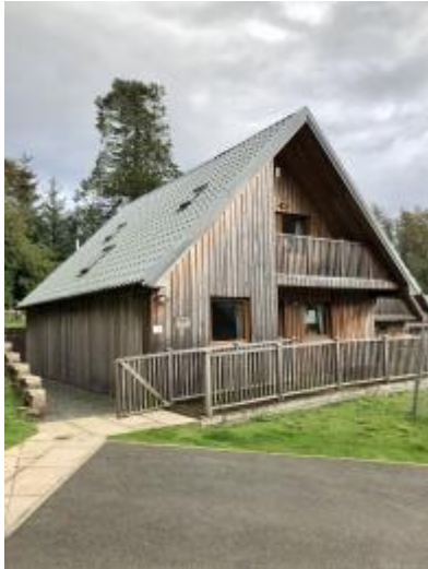
Showing car parking area and path up to Lodge 35