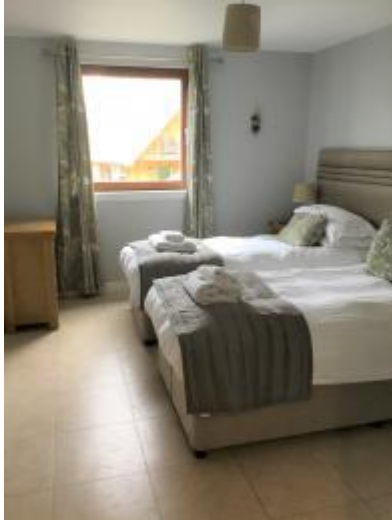
Downstairs Bedroom to Left Hand Side