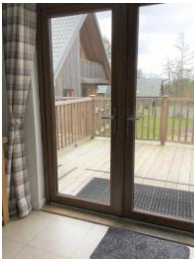
Patio Door leading to decking and hot tub