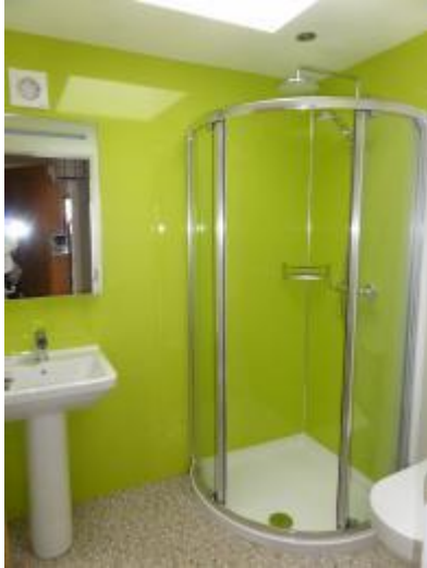
Downstairs Shower Enclosure