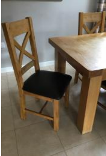
Dining Chair and Table