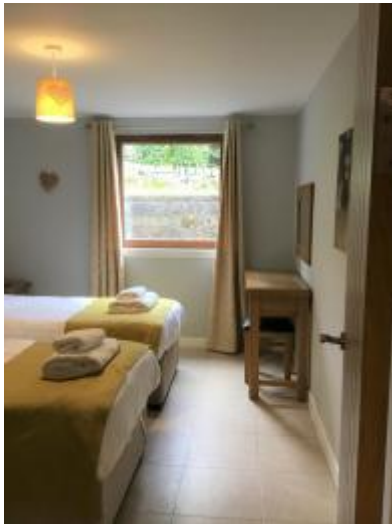
Downstairs Bedroom on Right Hand Side