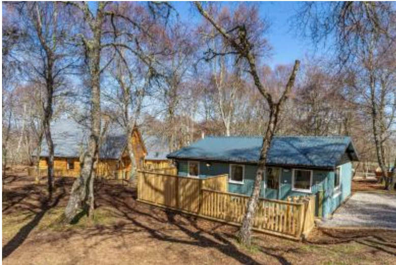
Heather Lodge 12 showing decking area