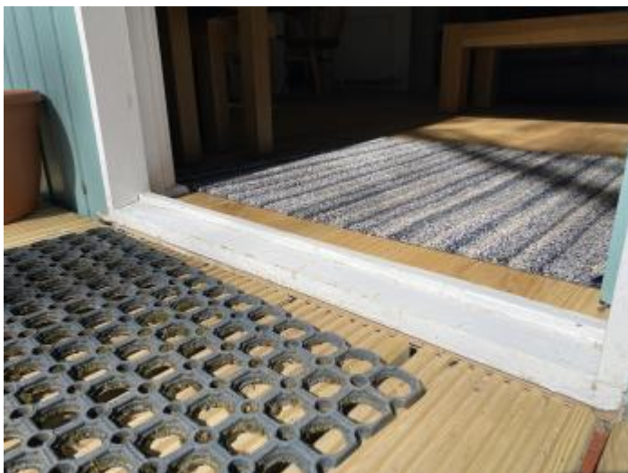
Step from decking into lodge