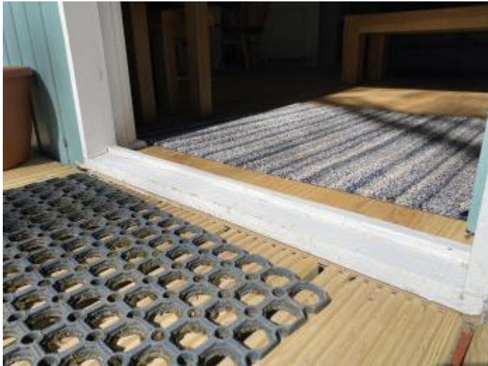
Step from decking into lodge