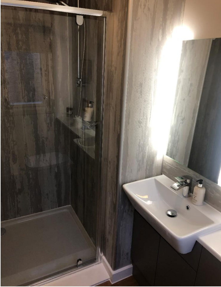
Heather Lodge 12 Shower Room