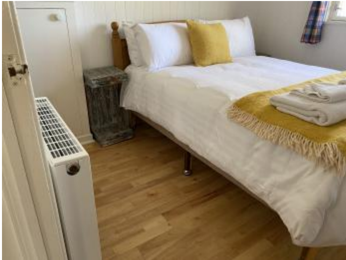
Showing Space from side of bed to wall in double bedroom