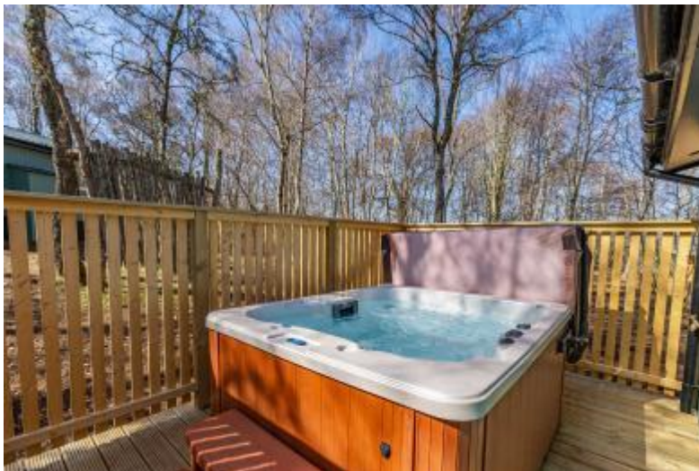
Heather Lodge 12 Hot Tub