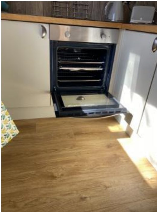
Heather Lodge 12 Oven