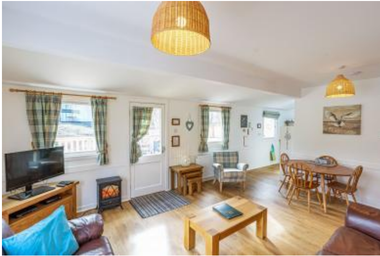
Heather Lodge 12 Open Plan Living Area with Dining Table