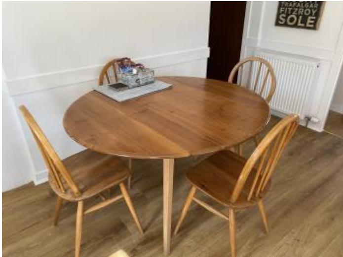
Heather Lodge 12 Dining Table