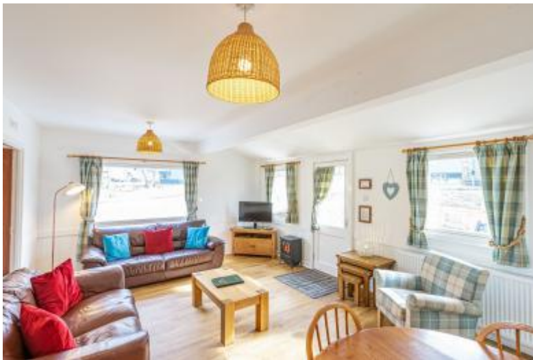
Heather Lodge 12 Open Plan Living Area with Dining Table