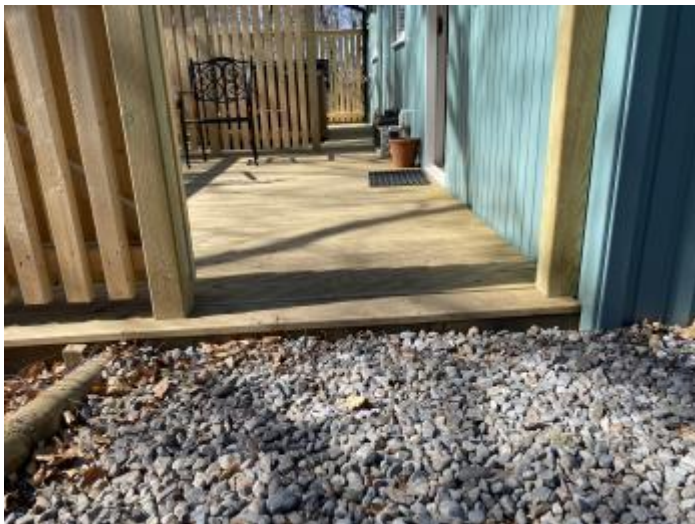
Small step up to lodge decking