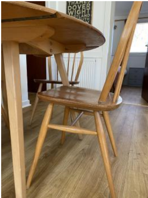
Heather Lodge 12 Dining Table