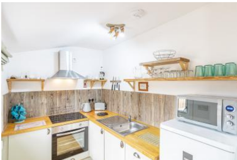
Heather Lodge 12 Kitchen