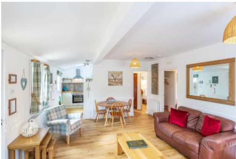
Heather Lodge 12 Open Plan Living Area with Dining Table