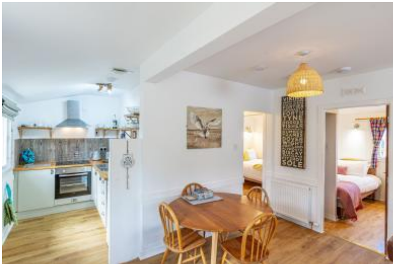
Photo showing opening to kitchen area