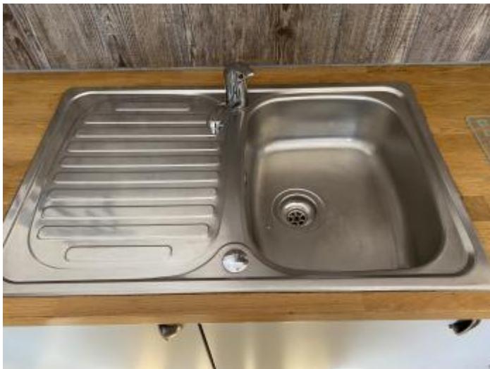
Heather Lodge 12 Kitchen Sink and Lever Tap