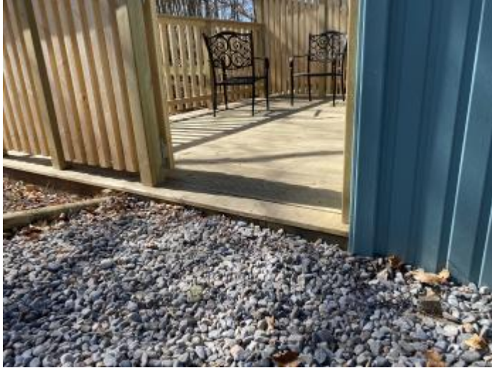
Step to Decking from Parking Area