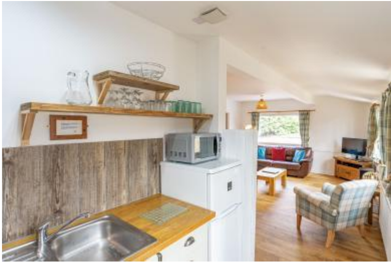
Heather Lodge 12 Kitchen