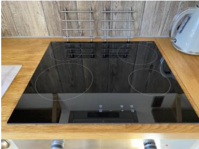
Heather Lodge 12 Induction Hob