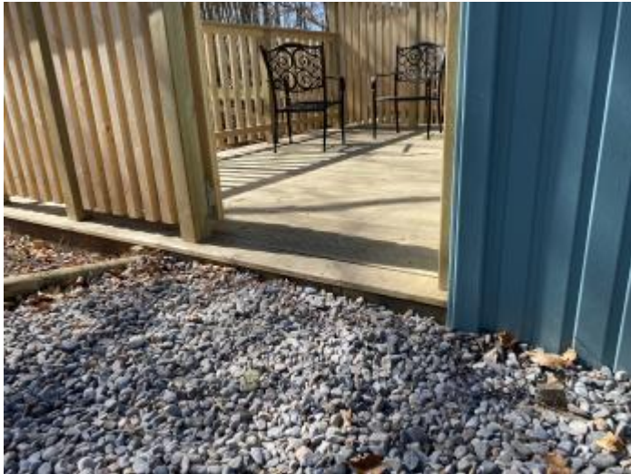
Step from parking area to decking