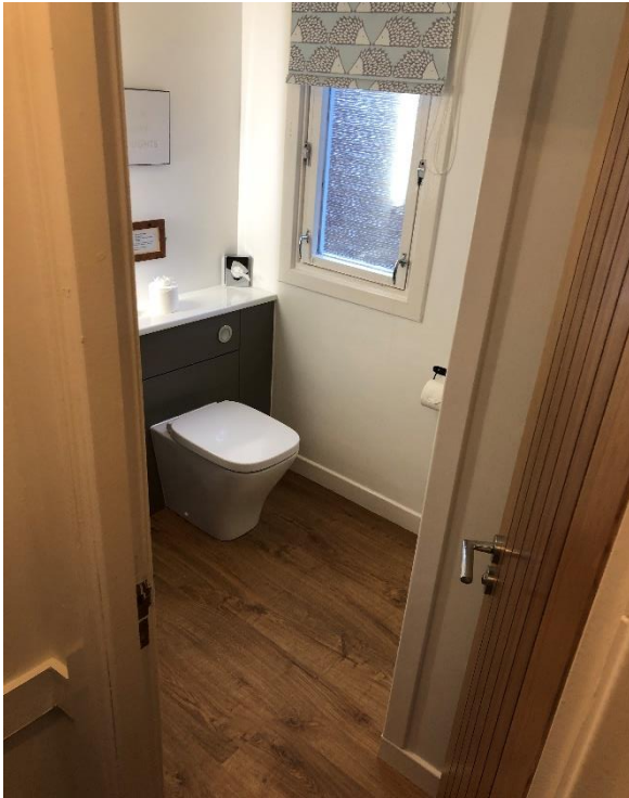
Heather Lodge 12 Toilet