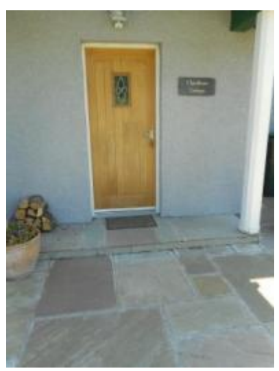
Chauffeurs Cottage Entrance