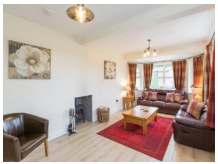
Chauffeurs Cottage Lounge