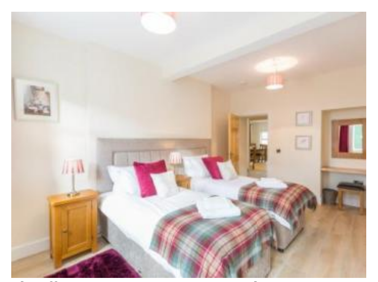
Chauffeurs Cottage Downstairs Bedroom