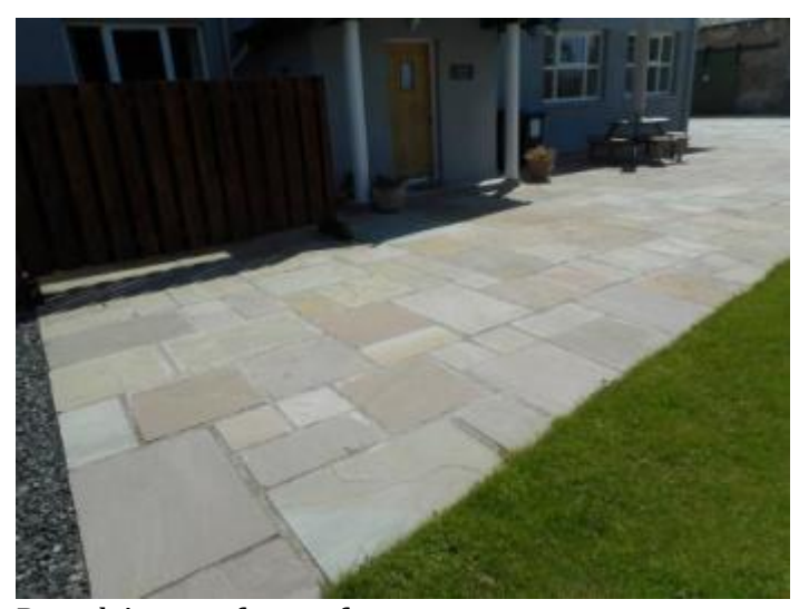
Paved Area at front of cottage