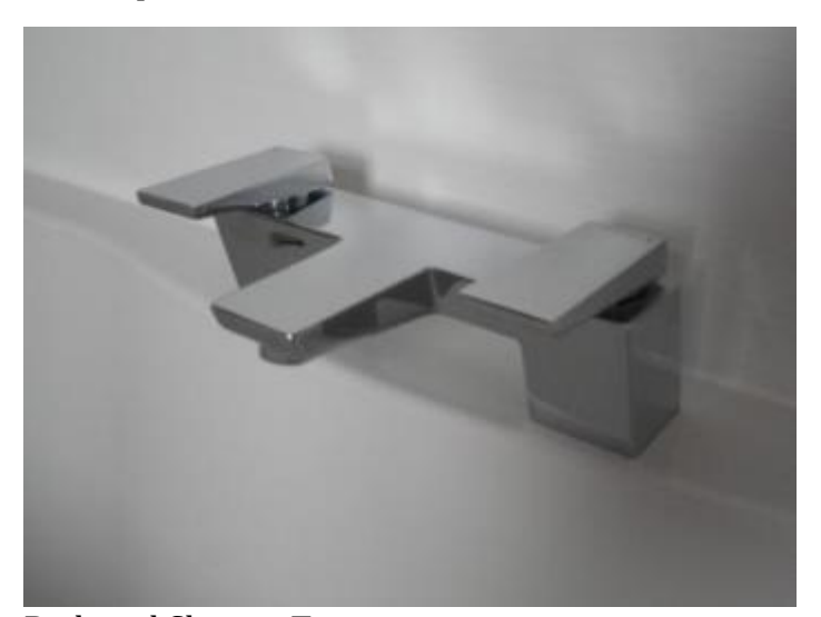
Bath and Shower Tap