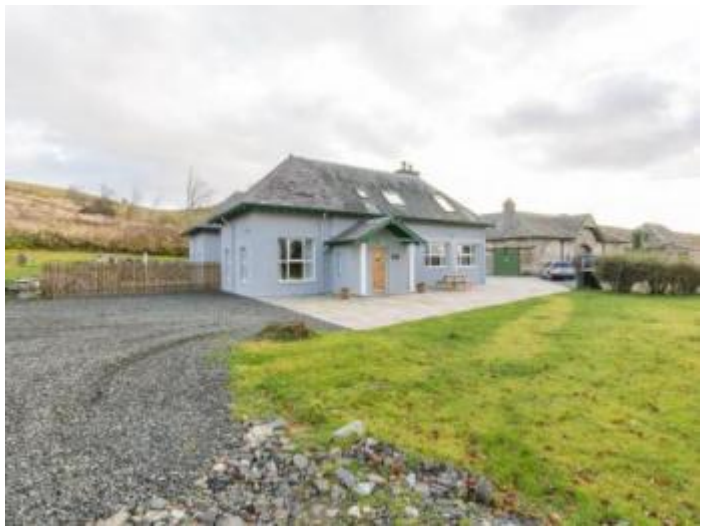
Parking to the left of Chauffeurs Cottage