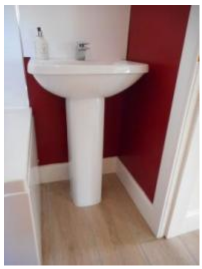
Downstairs Bathroom Sink