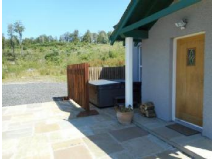
Patio Area with Private Hot Tub