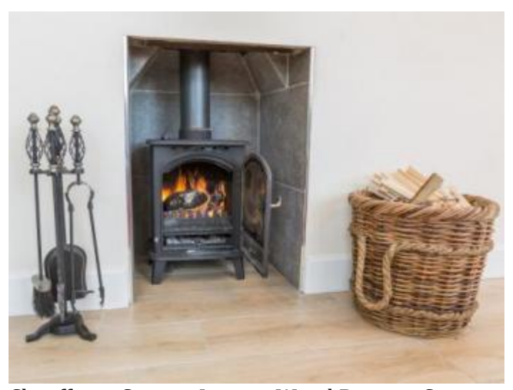
Chauffeurs Cottage Lounge Wood Burning Stove