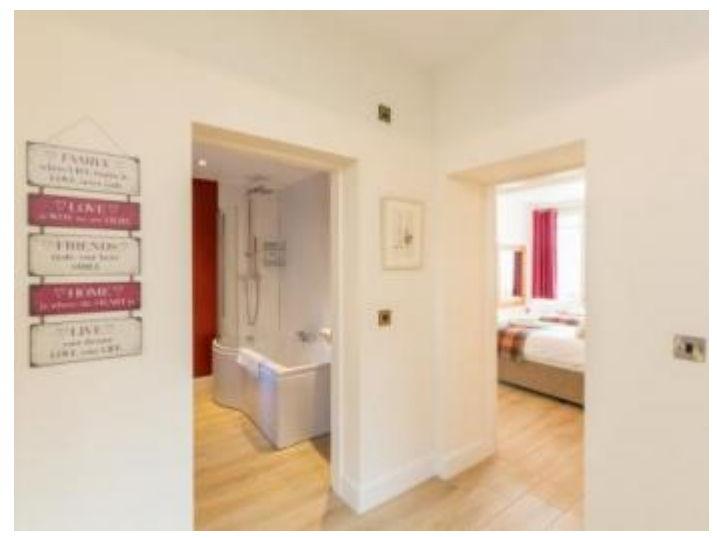
Showing Entrance to Downstairs Bathroom and Bedroom