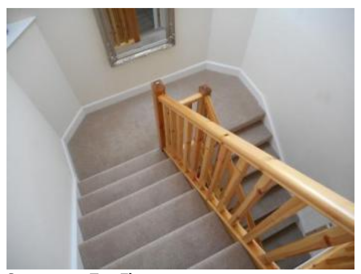
Staircase to Top Floor