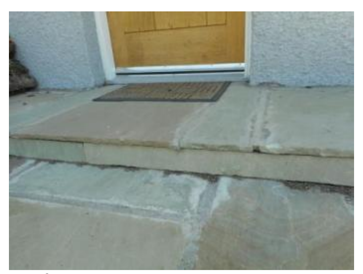
Step from entrance to patio area