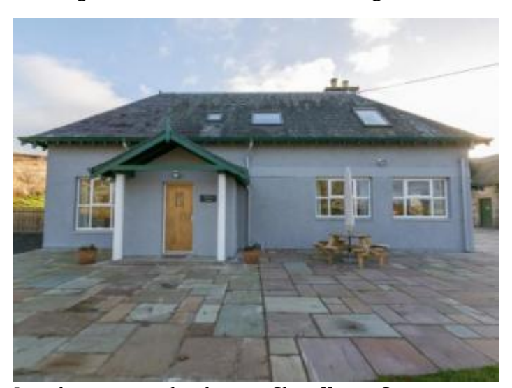
Level patio area leading to Chauffeurs Cottage entrance