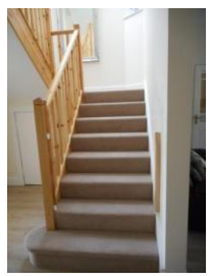
First set of steps