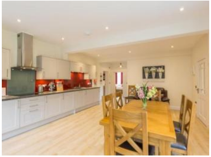
Chauffeurs Cottage Open Plan Kitchen Dining