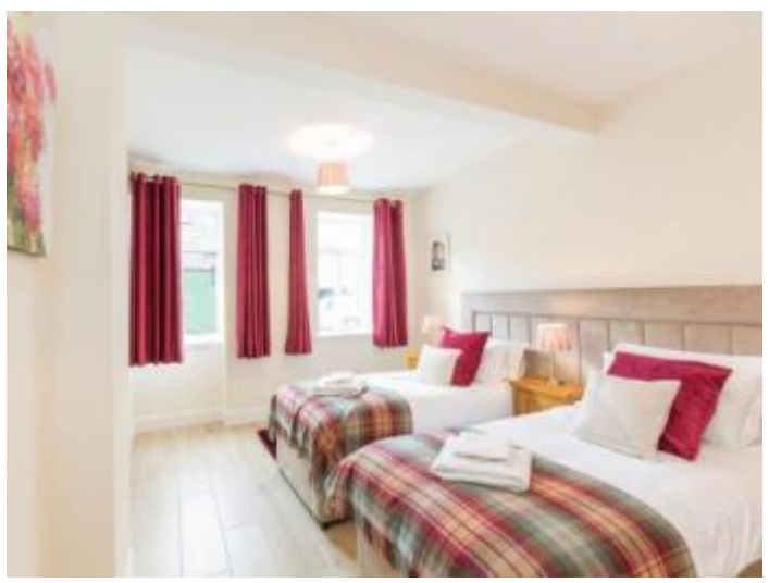
Chauffeurs Cottage Downstairs Bedroom