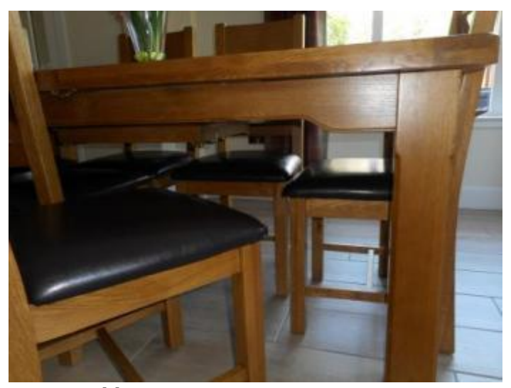
Dining Table Space