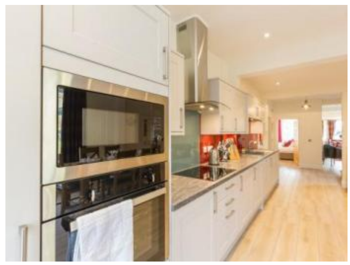
Chauffeurs Cottage Open Plan Kitchen Dining