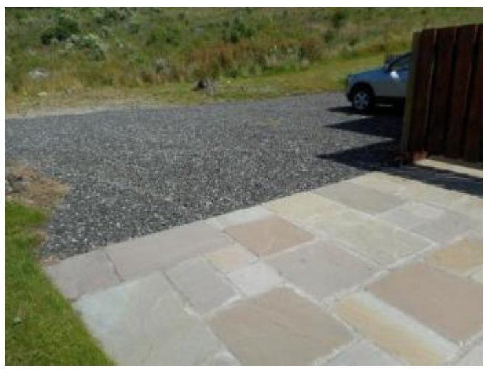
Parking Area leading to Paved Area