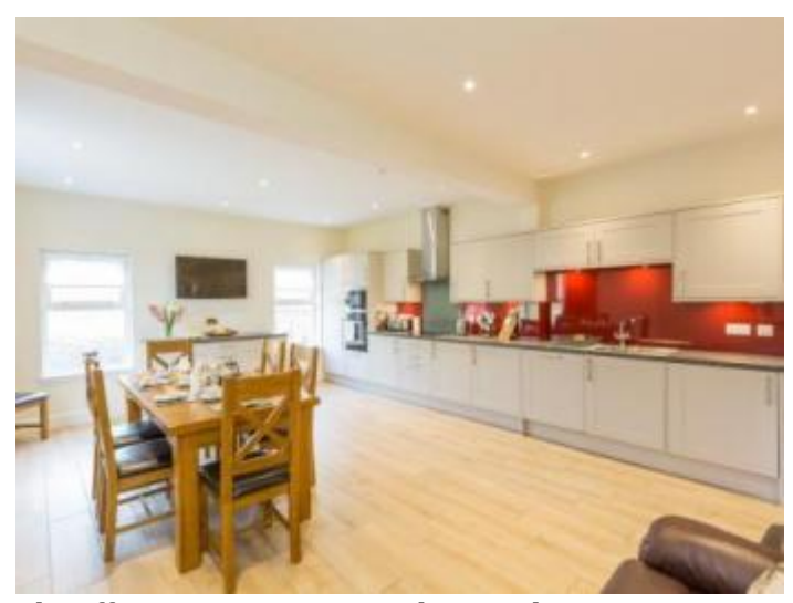
Chauffeurs Cottage Open Plan Kitchen Dining