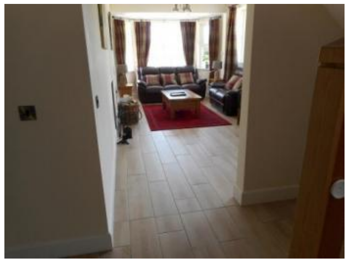
Showing Access to Lounge