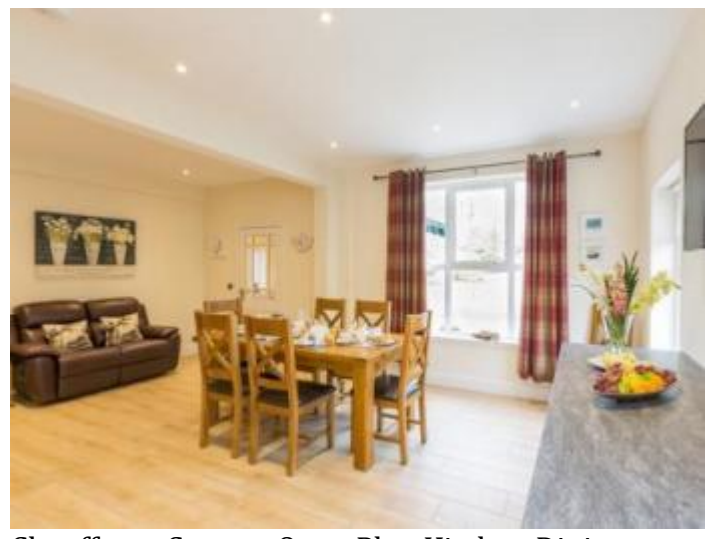
Chauffeurs Cottage Open Plan Kitchen Dining