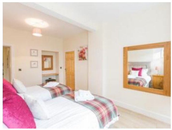
Chauffeurs Cottage Downstairs Bedroom